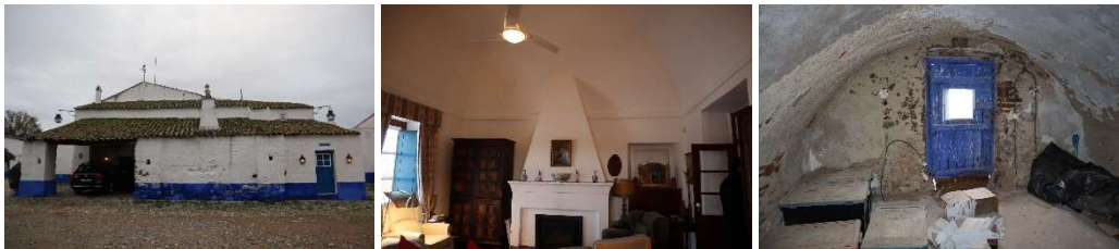
4 th day: 4/12/2022: