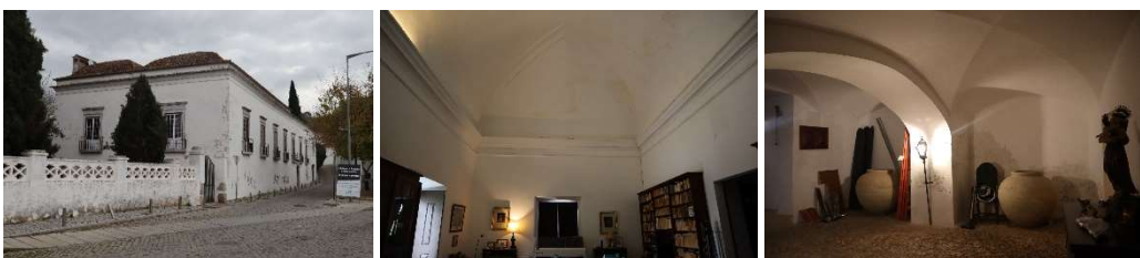
Serpa – Gavião Peixoto manor house