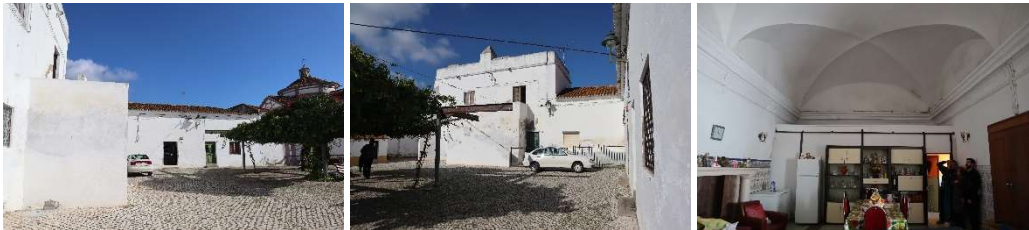
Vila Verde de Ficalho – Nossa Senhora das Pazes chapel: