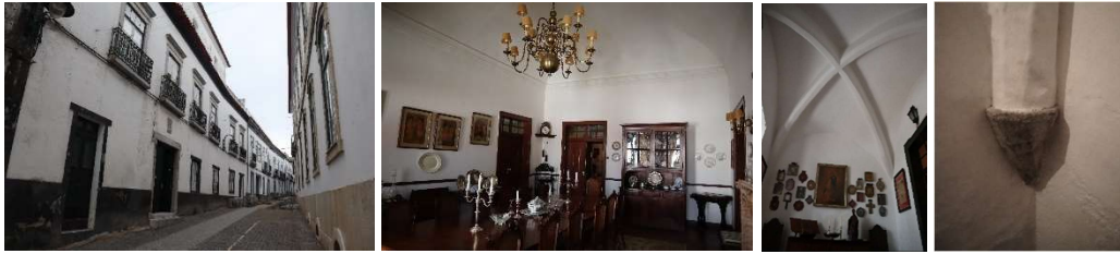
Serpa – town houses