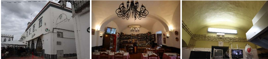
Santa Iria – Herdade do Peixoto farm