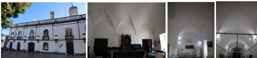
Serpa – Mosteirinho convent (Watch Museum)